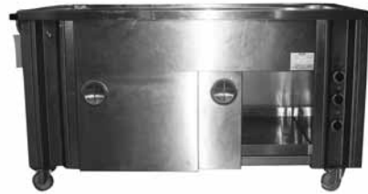
BAIN MARIE (4 WELL) & HOT CUPBOARD