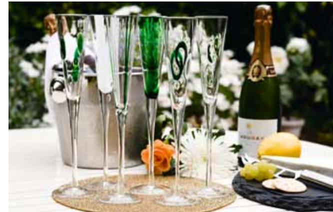
VIVA CHAMPAGNE GLASSES (COME IN MIXED RACK)