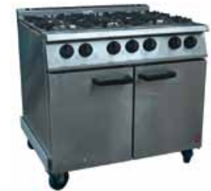
6 RING GAS COOKER