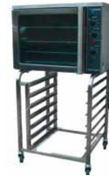
TURBO FAN OVEN