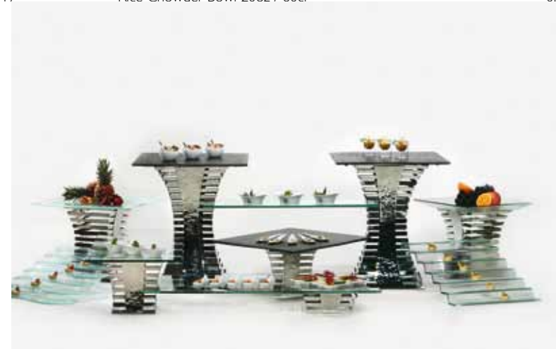
MANHATTAN BUFFET SYSTEM