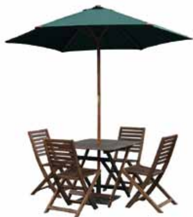
GARDEN FURNITURE SET