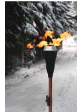
OIL LIT TORCH