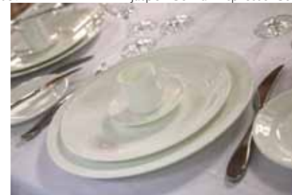
JASPER CONRAN WEDGWOOD

0333 NEW Jasper Conran Plate 10 5/8" / 27cm 10 0.89 0334 NEW Jasper Conran Plate 13" / 33cm 10 0.99 0374 NEW Jasper Conran Espresso Cup 3 1/2oz / 10.5cl 10 0.69