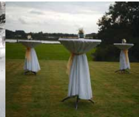
HIGH BAR WITH LINEN