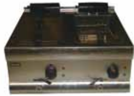
TWO BASKET ELECTRIC FRYER