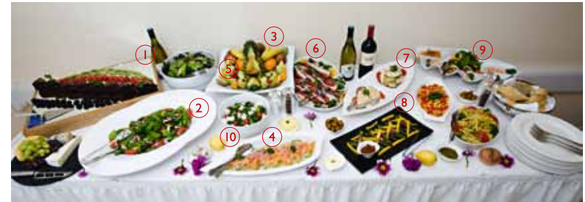
BUFFET SALAD PLATTERS