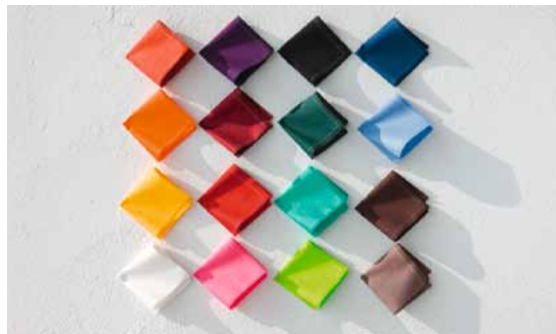
LINEN SINGLE USE - 100% COTTON (AVAILABLE IN MULTIPLE COLOURS)