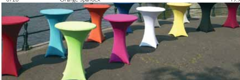
SPANDEX FOR HIGH BAR TABLE